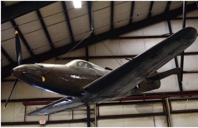
More pictures from March Field Museum